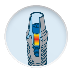
...improved safety through integrated protection